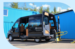
WHEELCHAIR ACCESSIBLE VEHICLES