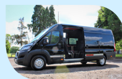
PRODUCTION, TV & MUSIC INDUSTRY VEHICLES