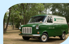
BESPOKE & SPECIALIST VEHICLES