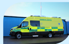
MEDICAL SERVICE VEHICLES