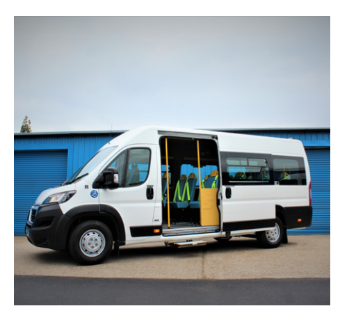
BOXERS IN BUILD We have lots of new Peugeot Boxers in build for a Southern costal based local authority.