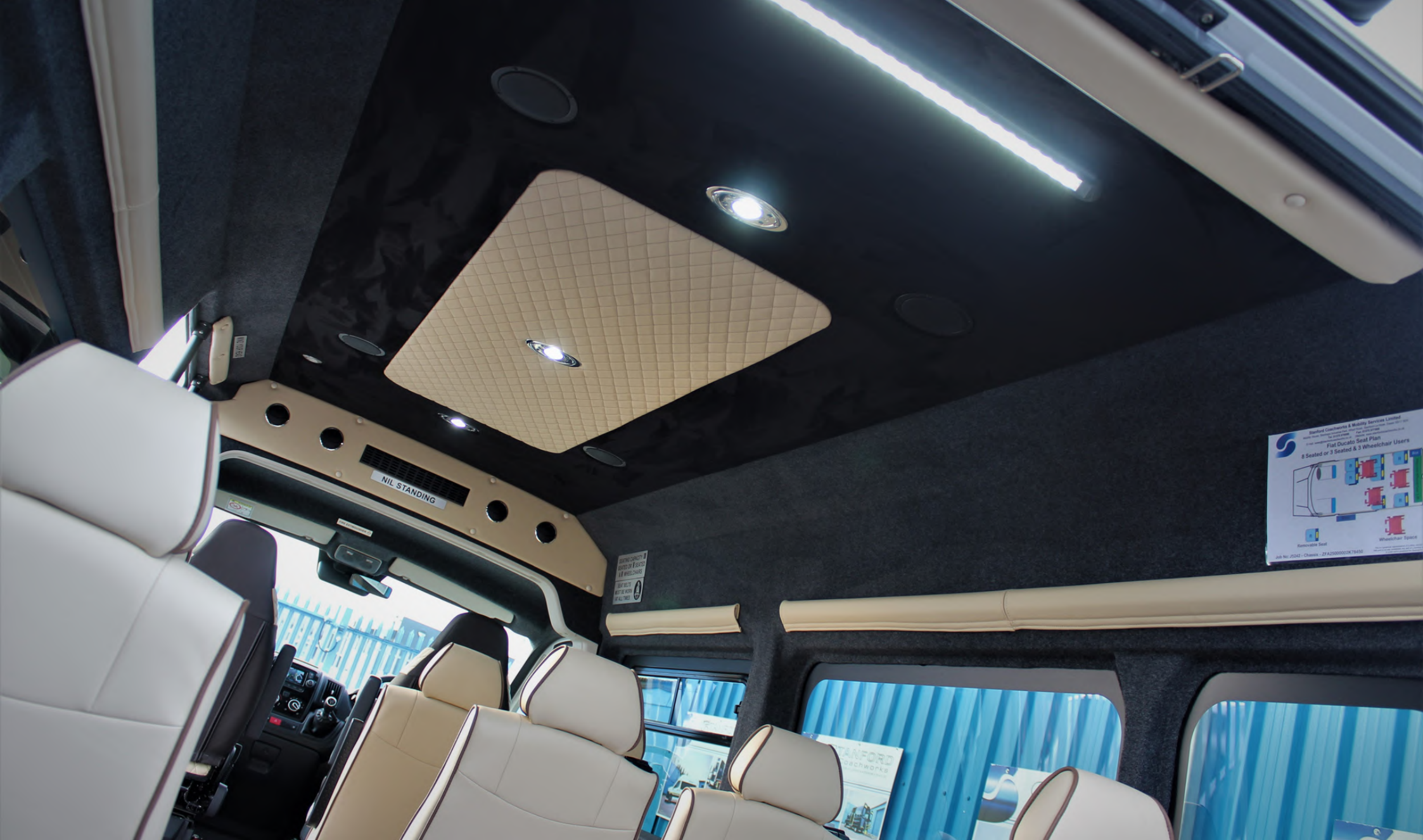
Custom-stitch feature roof panel and LED lighting.