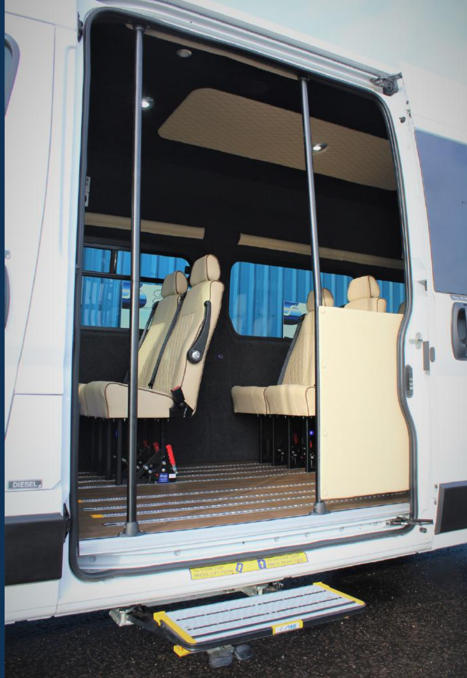
Pedal operated manual side step.