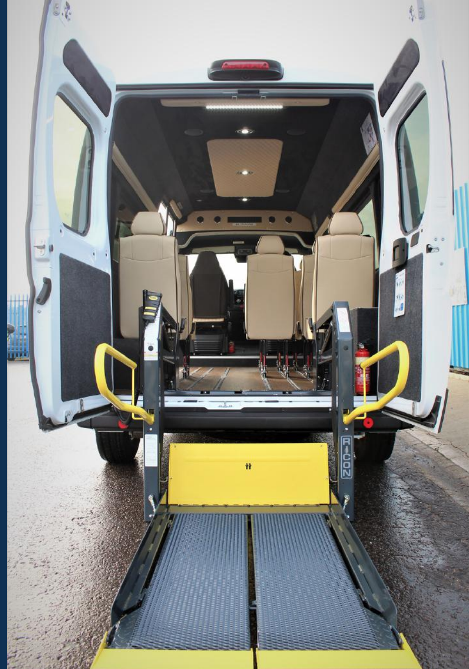
Internal tail lift.