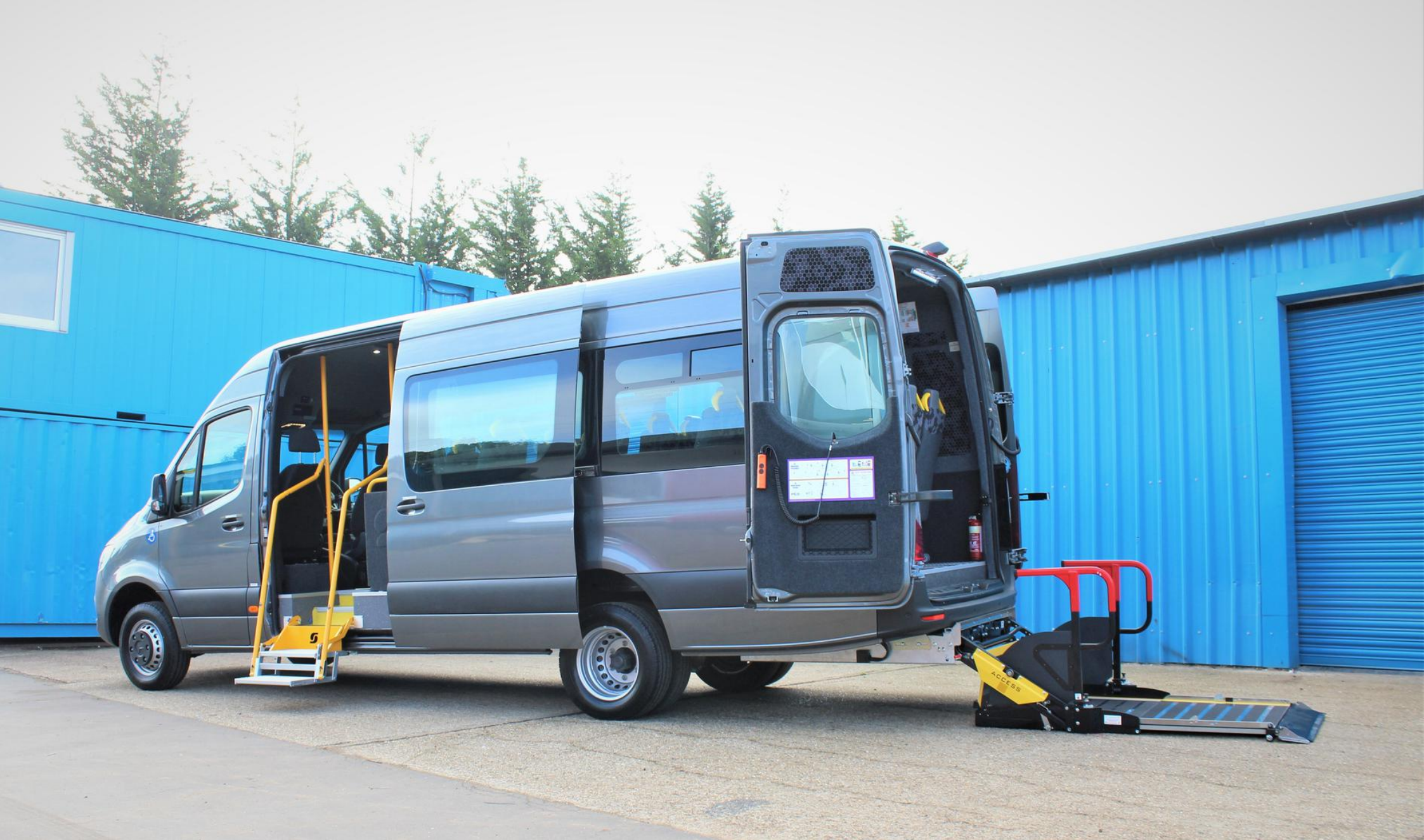
L4H2 Mercedes Sprinter Flat Floor with SCW exclusive lightweight fold-out side step.