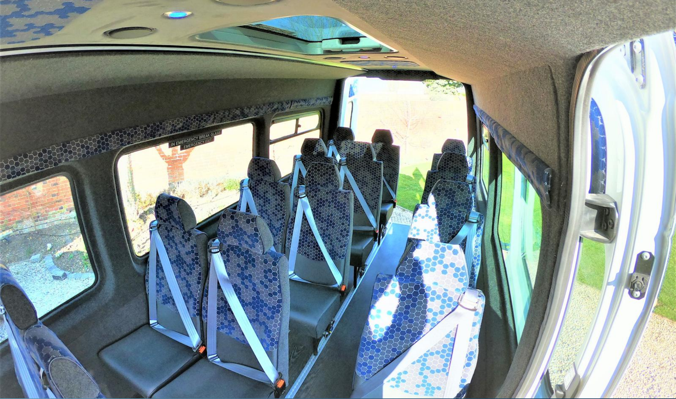
Patterned moquette interior with wiper clean bases.