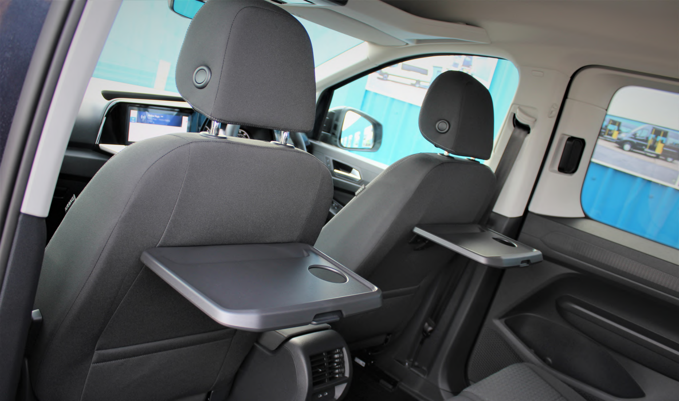
Passenger cabin with fold-up tables.