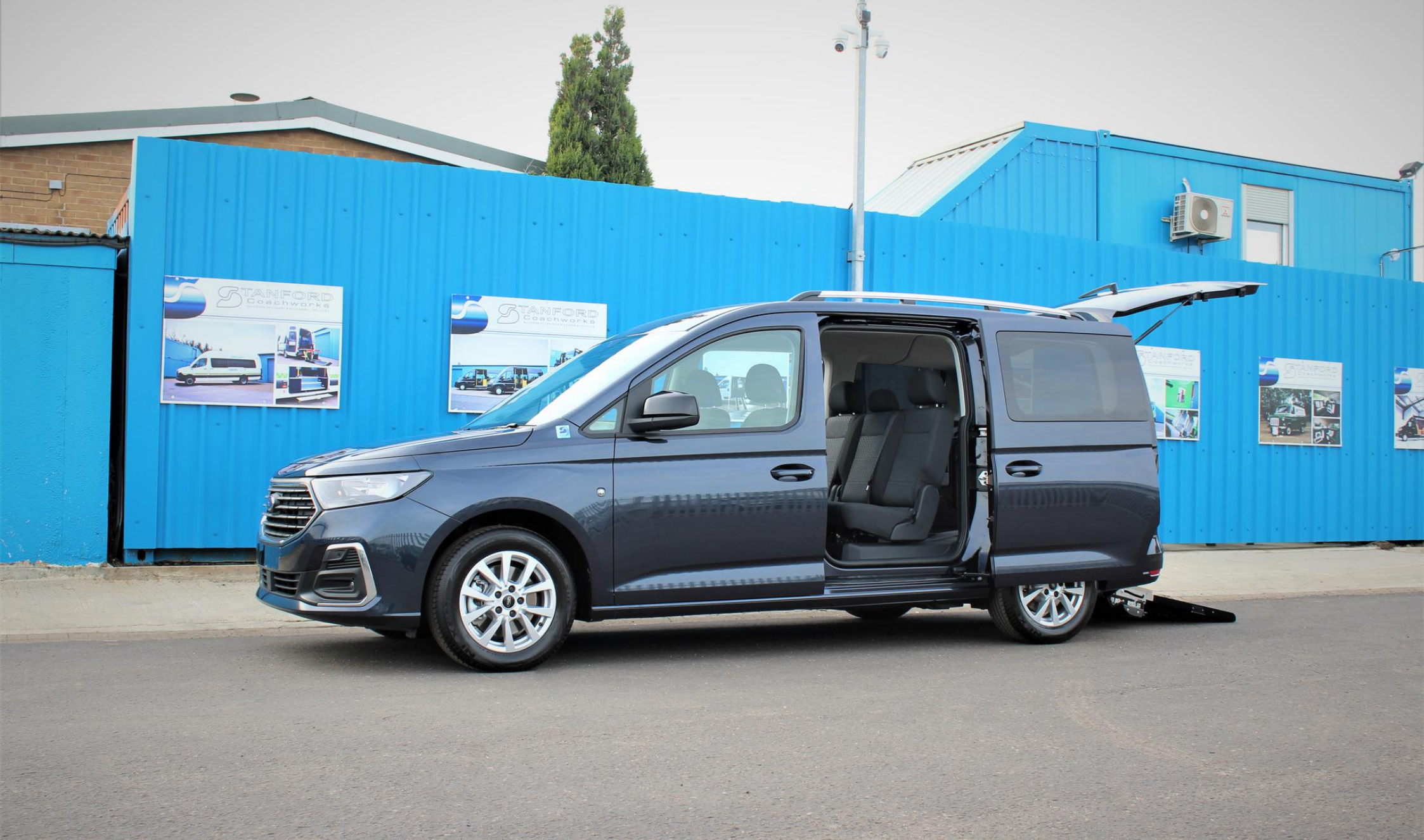
Ford Tourneo Connect L2 with twin side load doors.