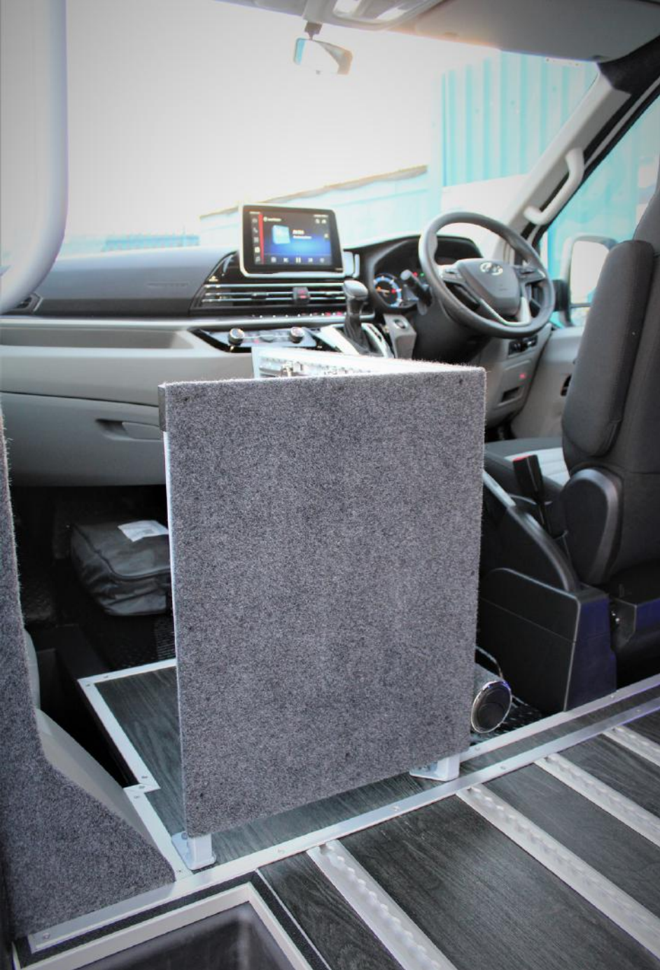
FRONT LUGGAGE PEN