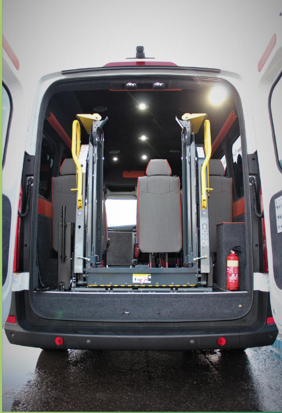
TAIL LIFT STOWED