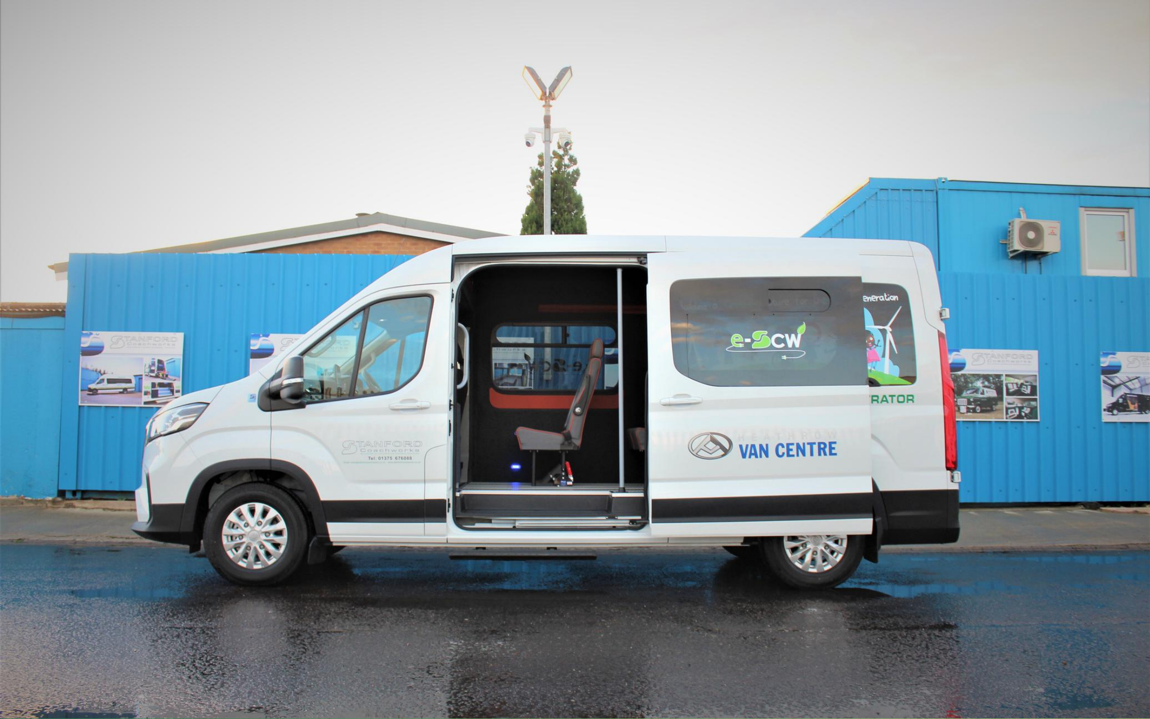
SIDE LOAD DOOR WITH ELECTRIC FACTORY SIDE STEP