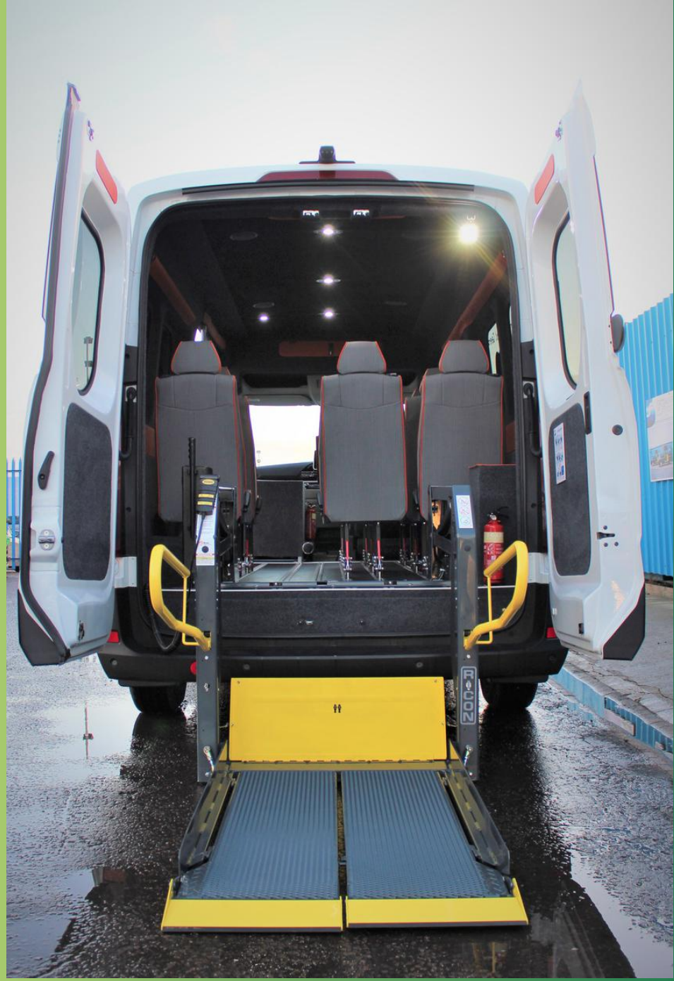
TAIL LIFT IN USE