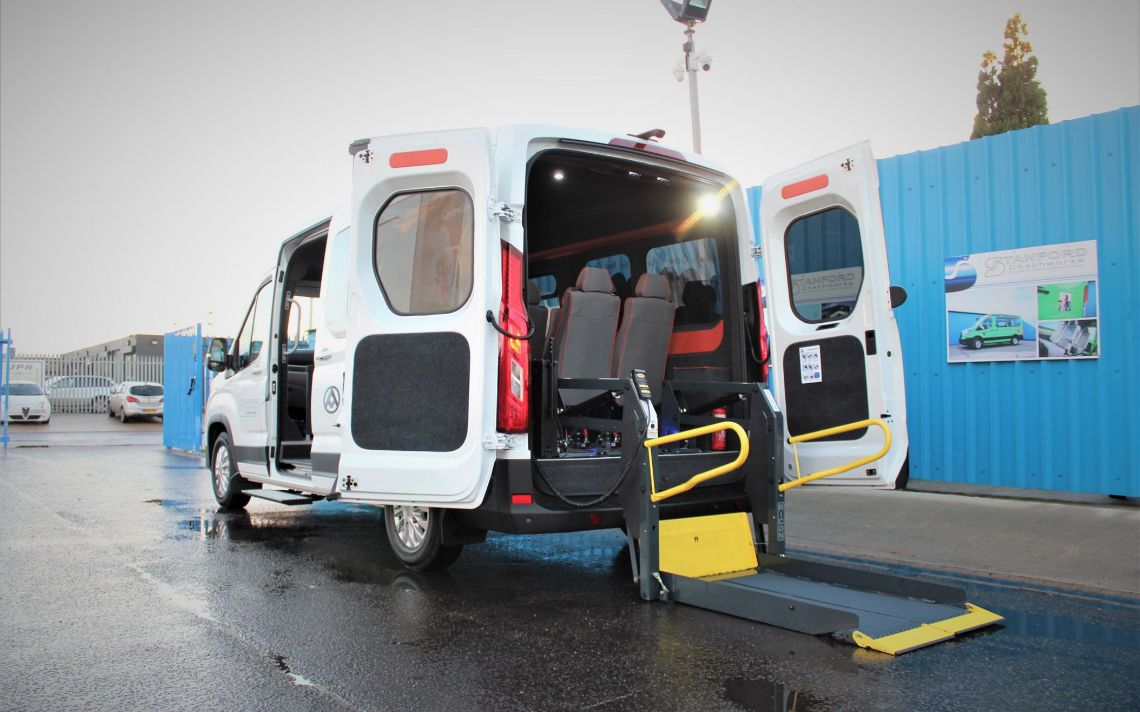
INTERNAL TAIL LIFT