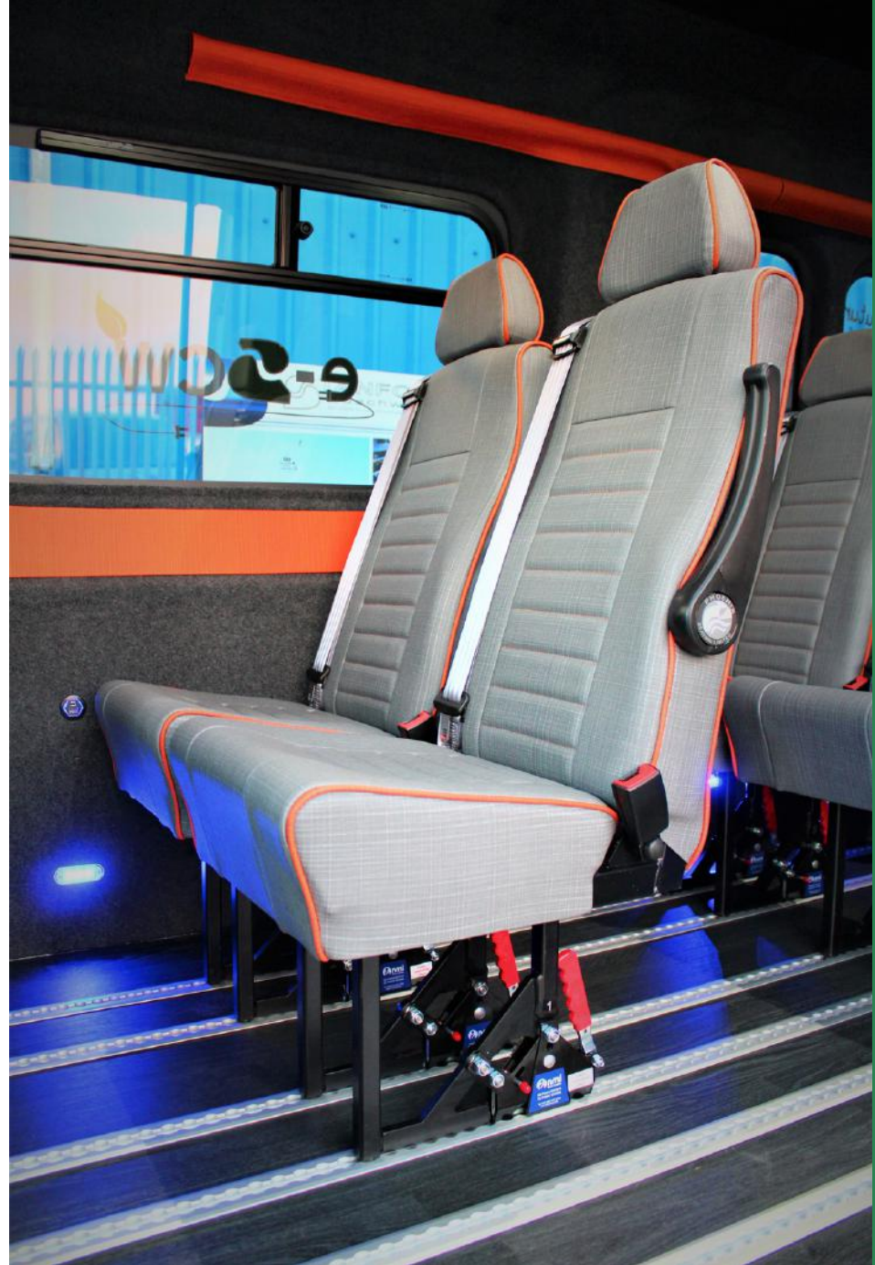
PREMIUM PASSENGER SEATS