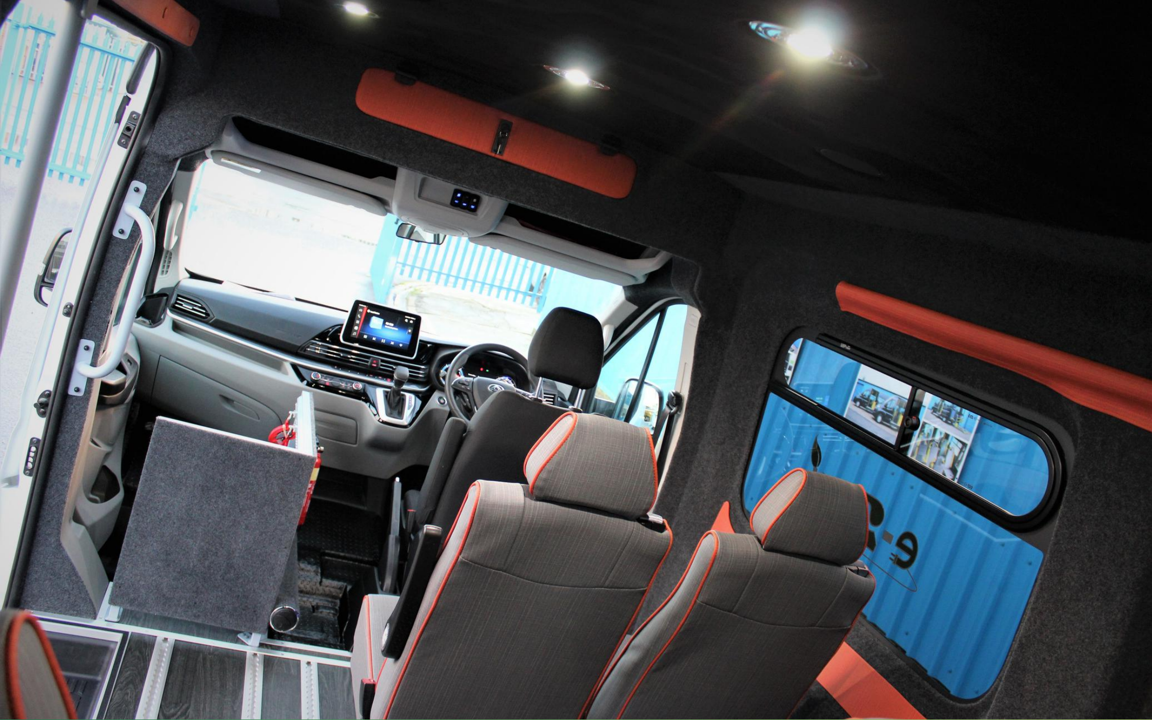
OVERHEAD LOCKABLE STORAGE COMPARTMENT