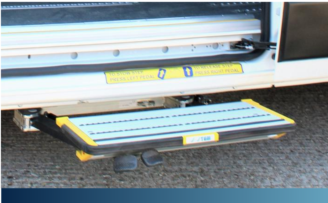
PEDAL OPERATED SIDE STEP