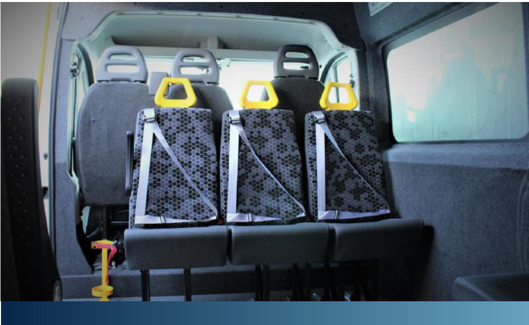
TRIMMED SEATING OPTION