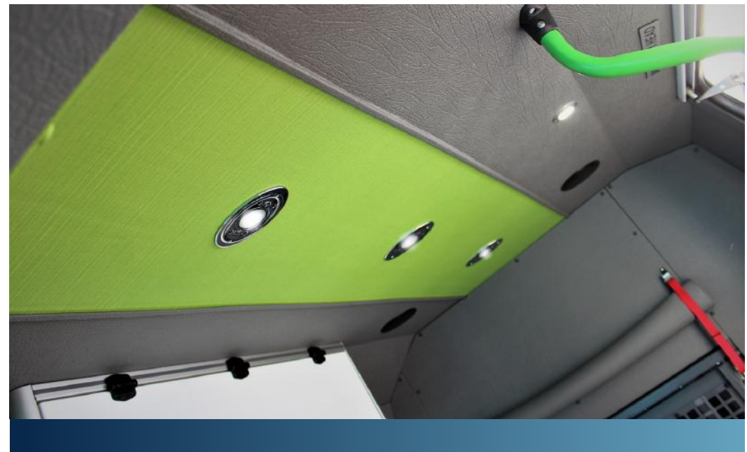
LED INTERIOR LIGHTING