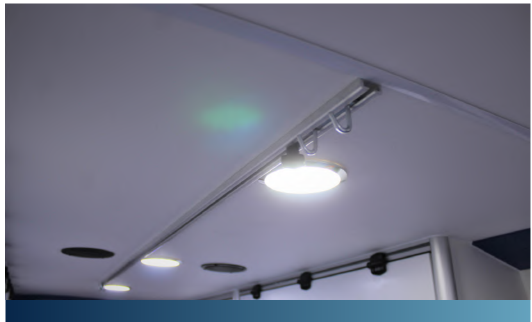
IV DRIP RAILS