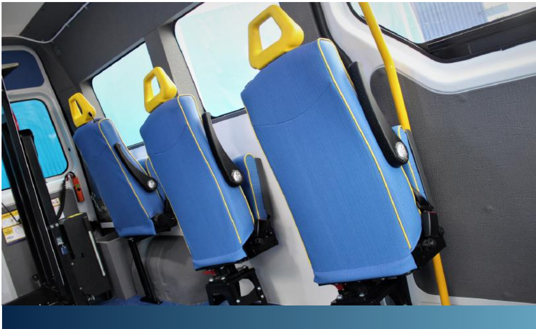
TIP & FOLD SEATING