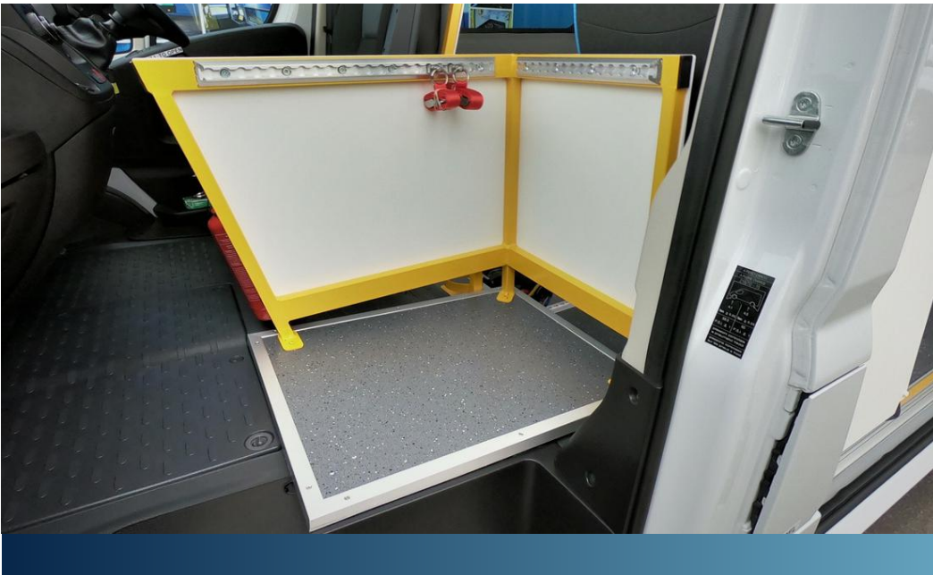
FRONT LUGGAGE PENS