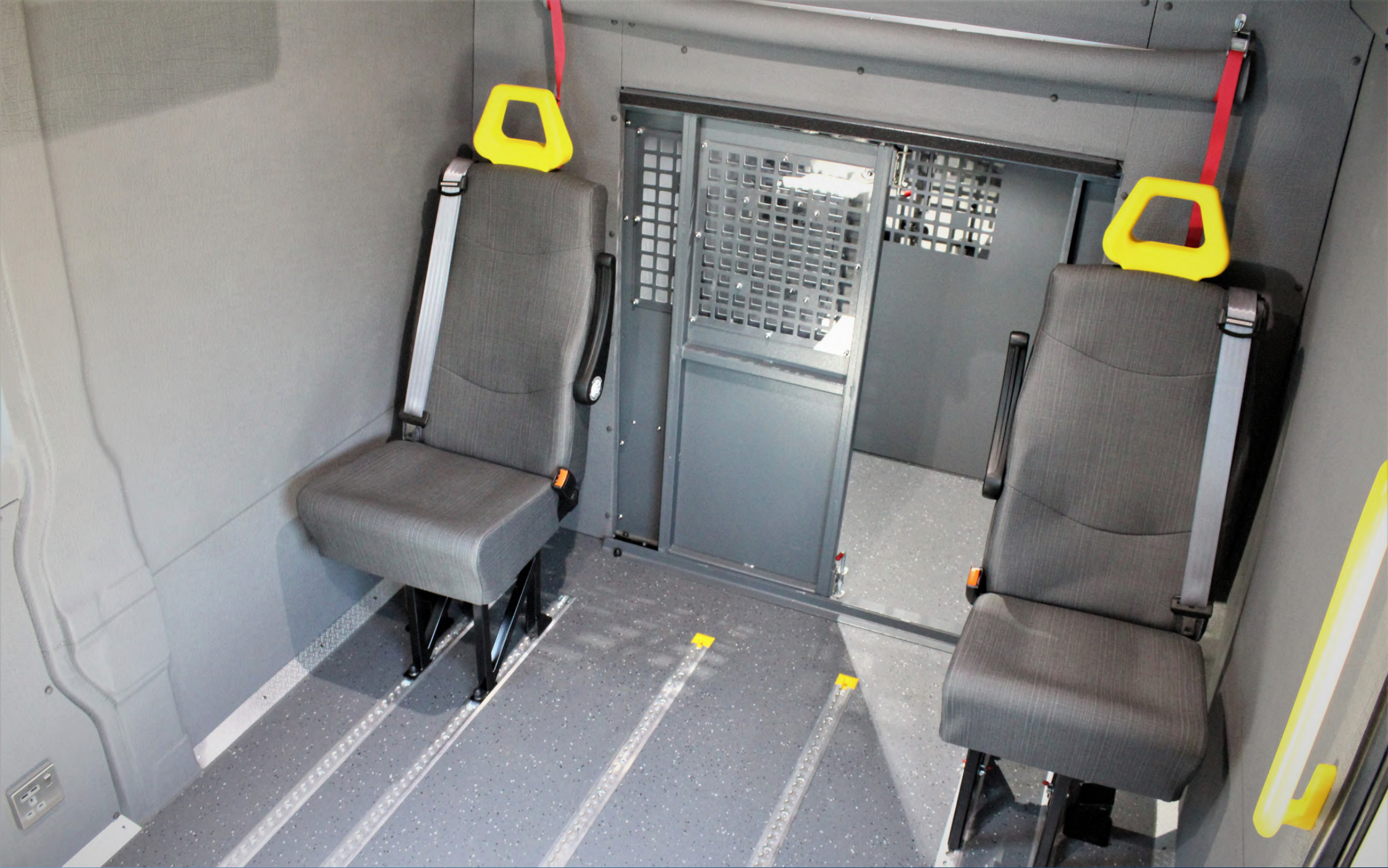
FULL WIPE CLEAN INTERIOR OPTION