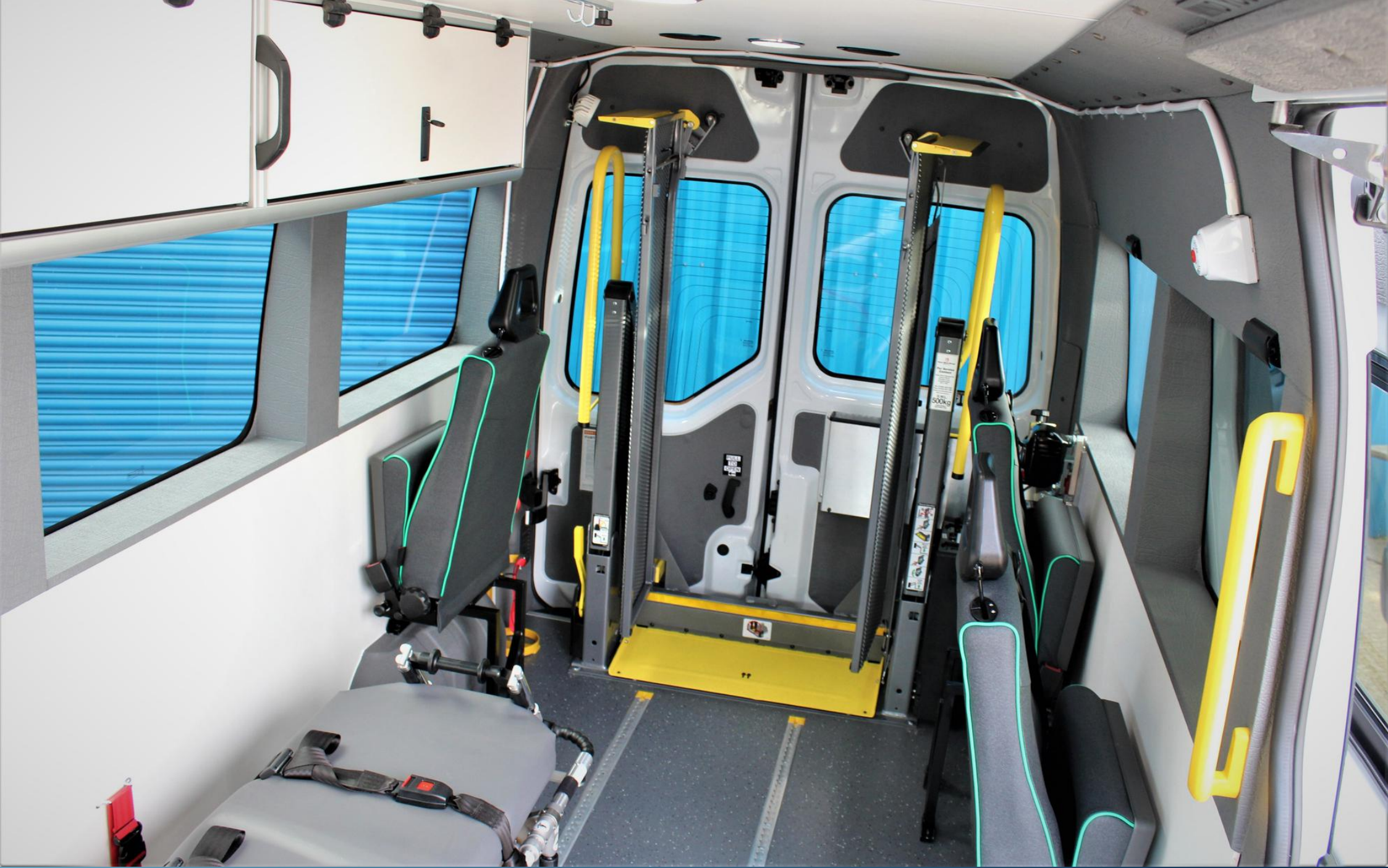
FLEXIBLE DESIGN TO FACILITATE SEATS, WHEELCHAIRS & STRETCHERS