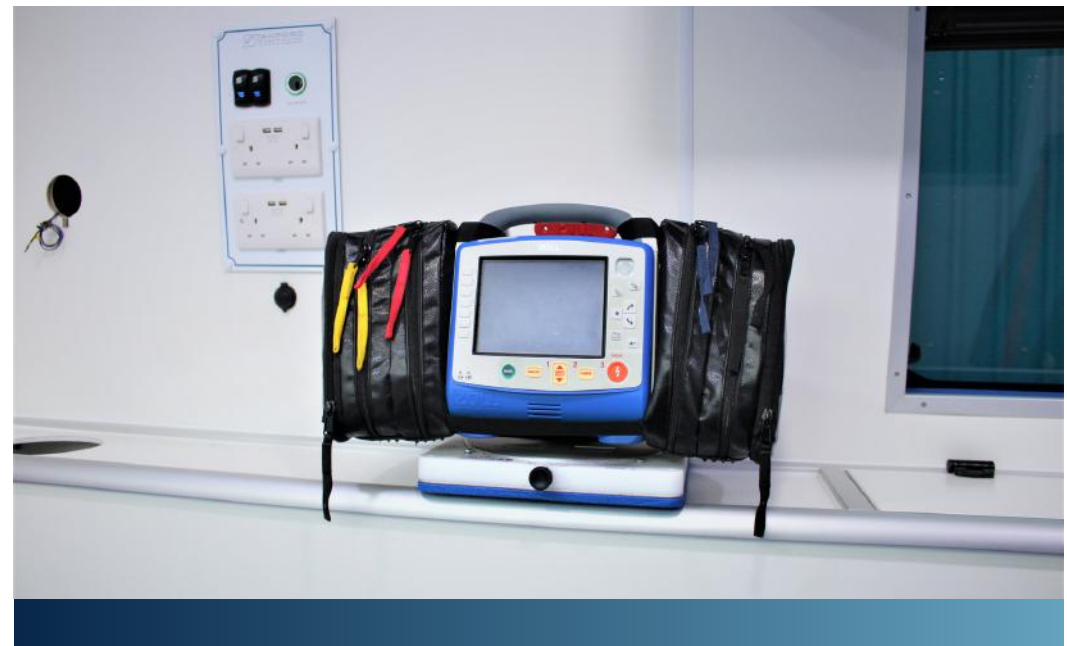
SPECIALIST MEDICAL EQUIPMENT