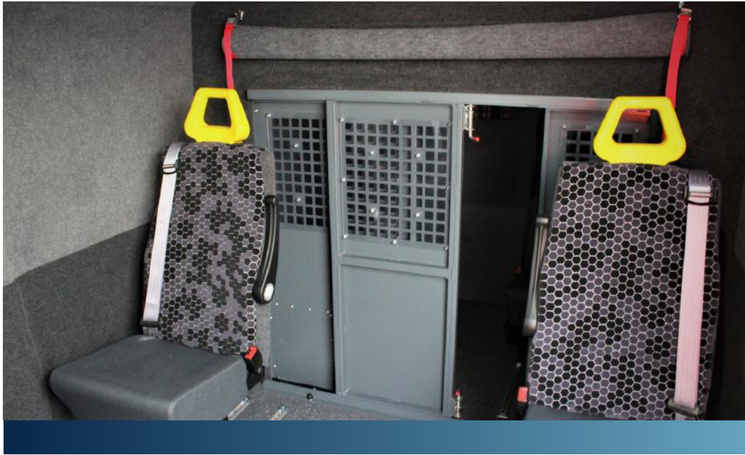
ROLL UP CELL COVER