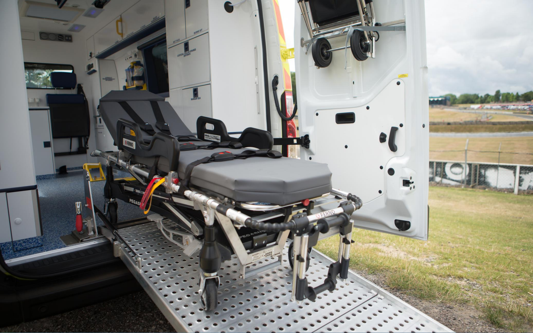
HEAVY-DUTY FOLD-OUT RAMP