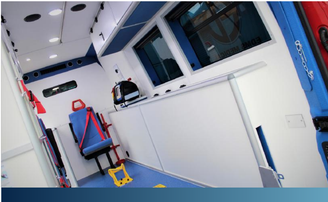
CUSTOM-BUILT STORAGE SPACES