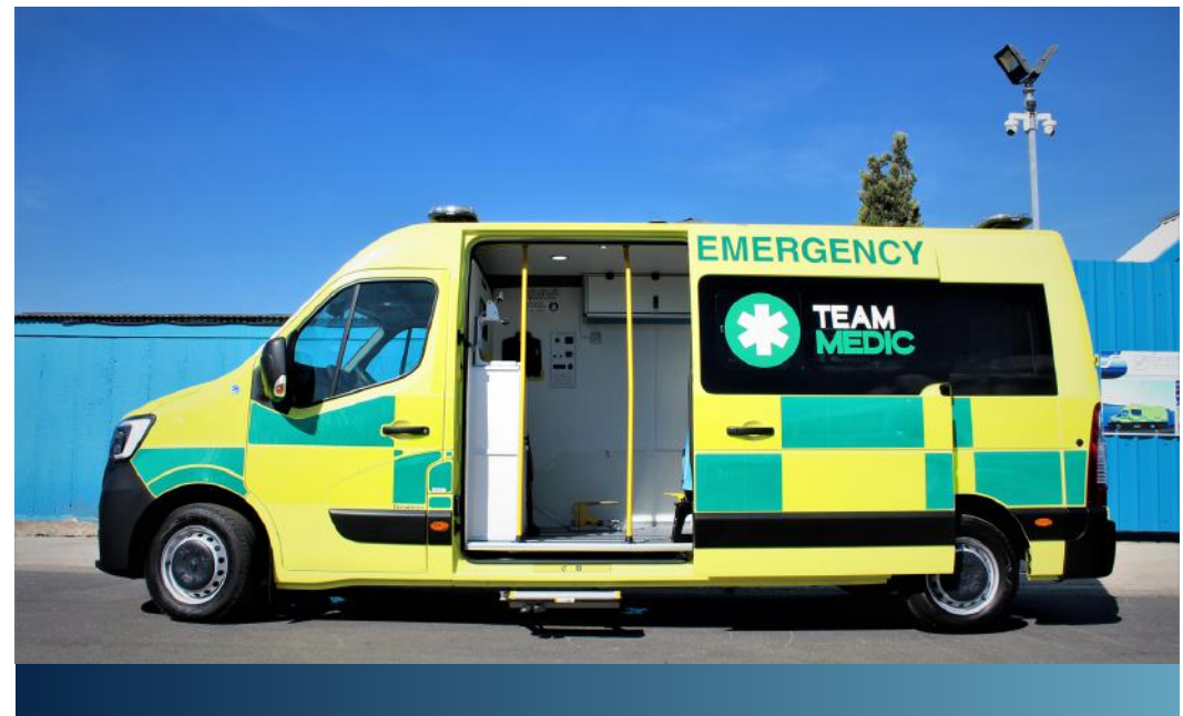
FRONT LINE AMBULANCES