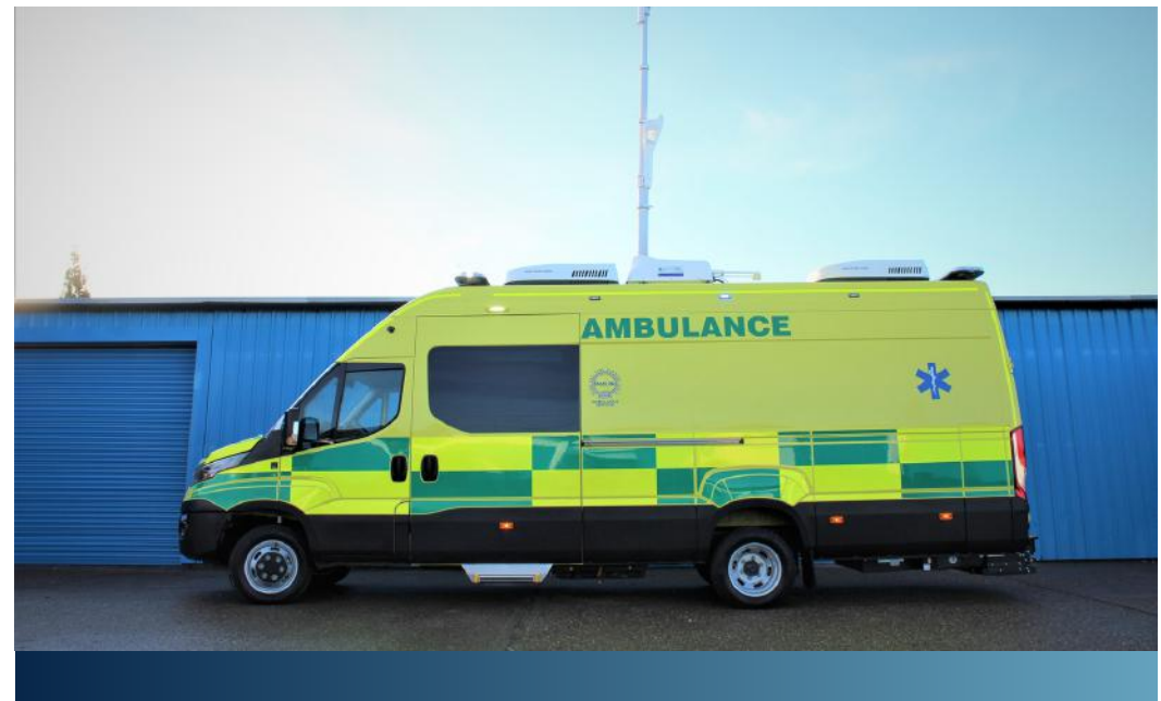
SPECIALIST MEDICAL CONVERSIONS