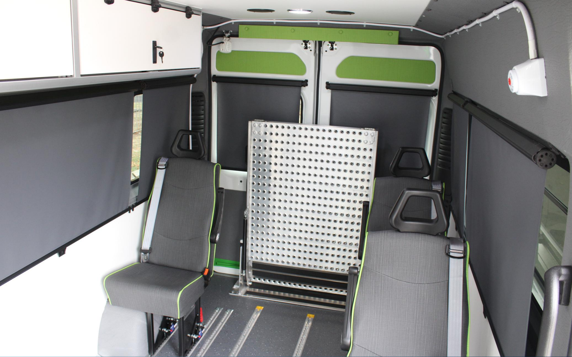
FULL WIPE CLEAN INTERIOR WITH REMOVABLE SEATING