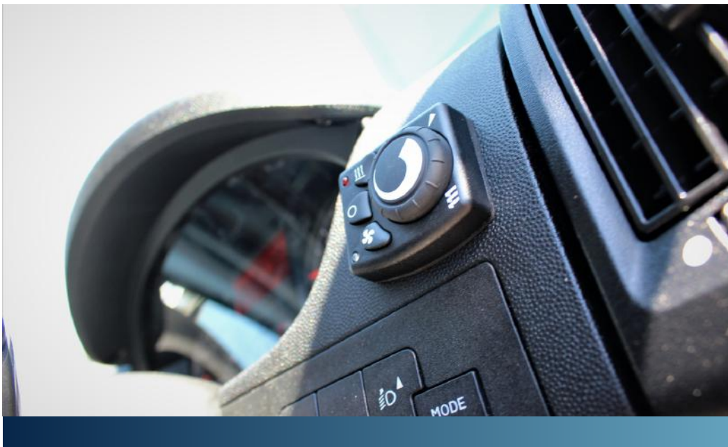
HEATING & AIR CONDITIONING