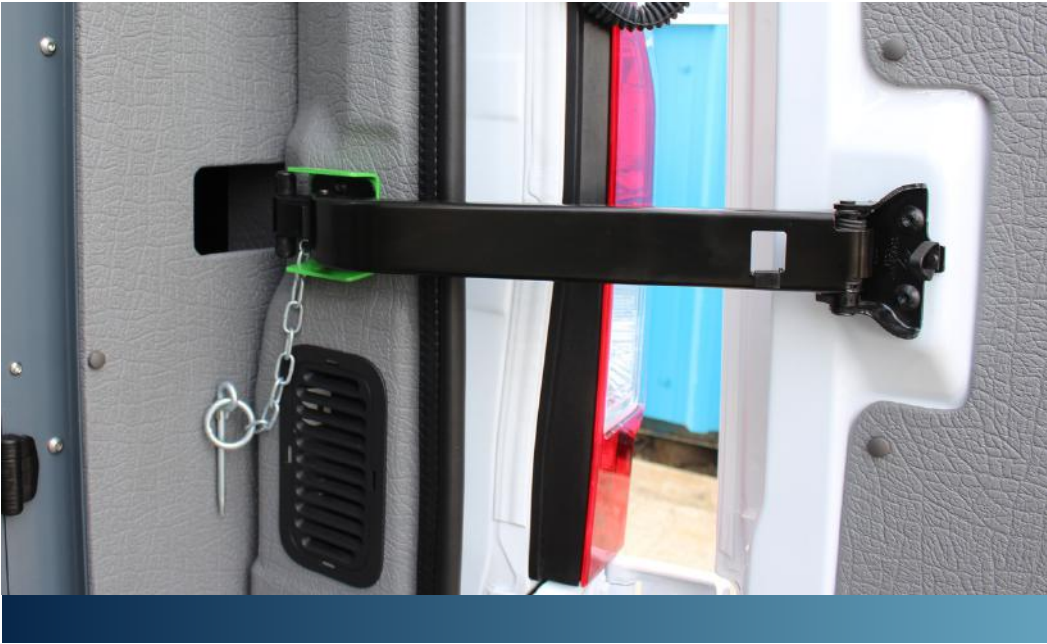
HEAVY-DUTY REAR DOOR STAYS