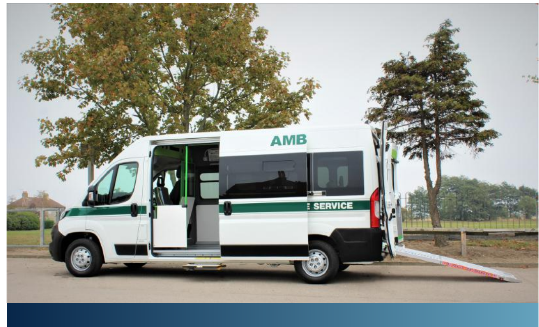
PRIVACY TINTED WINDOWS