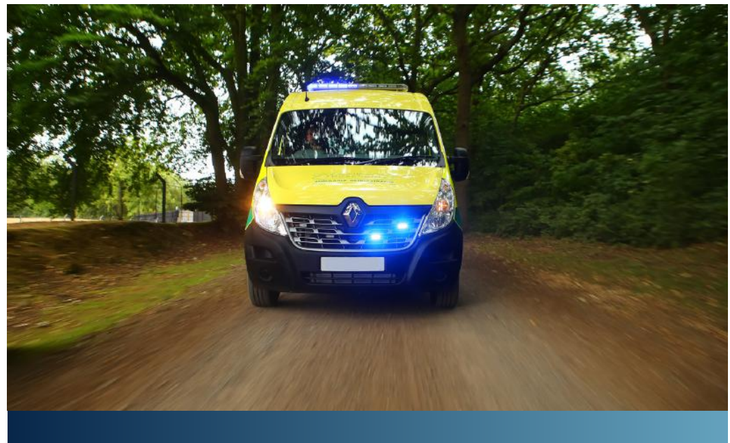
BLUE LIGHTS & SIRENS