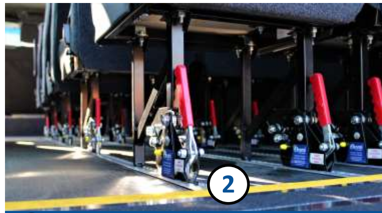
2 NMI removable legs.