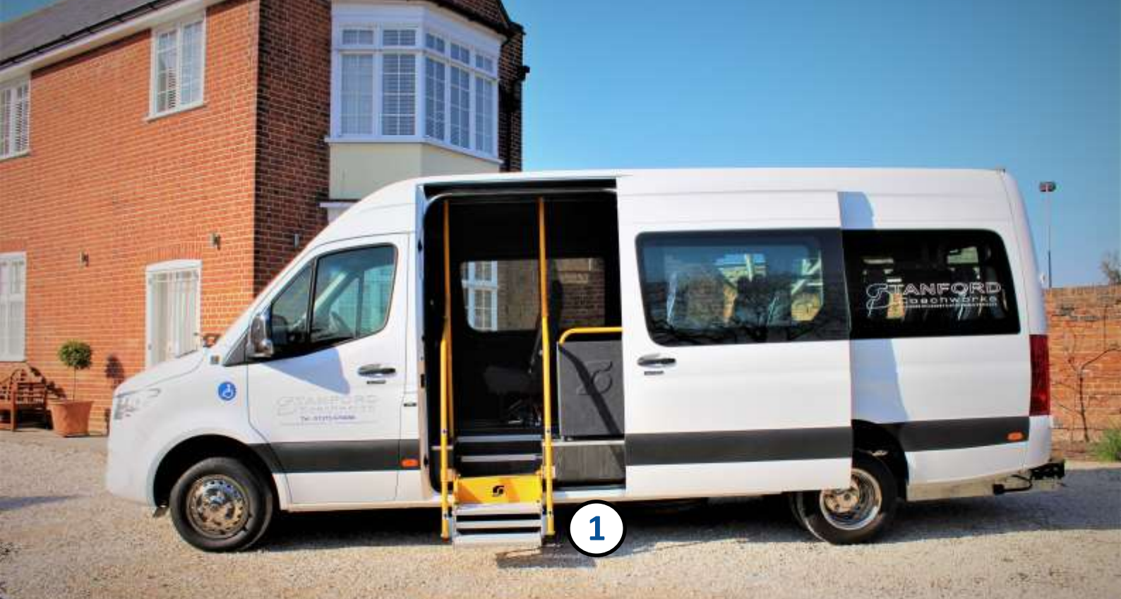
1 New style SCW double fold out step for assisted entry and exit.