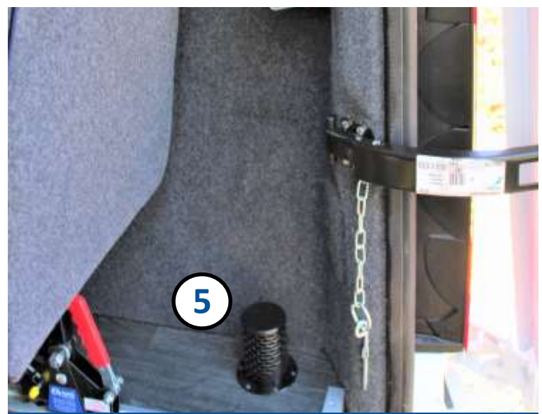
5 Black steel heater trumpets.