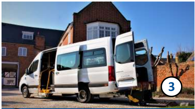
3 PLS underfloor split platform tail lift.